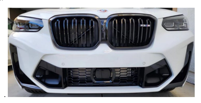
Example of "failure to display registration plates"

A license plate serves as an identifier, and having two is an added benefit. Front plates can help accurately identify stolen cars, or vehicles involved in hit-and-runs or other crimes. Reflective front plates can significantly improve the ability to identify vehicles on the road at night, reducing the risk of crashes. Front plates make it easier for law enforcement and government agencies to identify vehicles that are speeding and to verify registration stickers. They can also be helpful when identifying a ride share as it pulls up to the curb or finding your car in a parking lot full of silver cars.